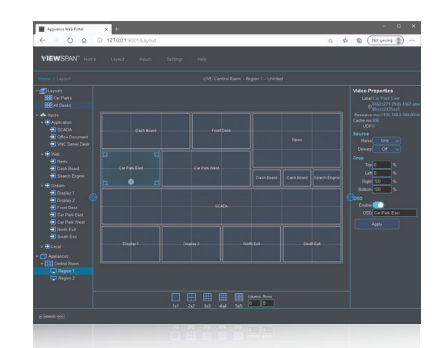
Multiple display monitor layouts can be defined, saved and selected under operator control or triggered by alarms.

Panoramic fisheye camera lens de-warping is performed on the GPU for optimum performance.