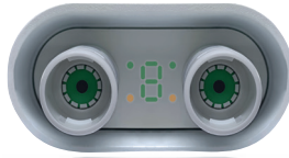
Hidden till lit 7 Segment LED Indicator shows power level and status