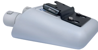
Rear Mounting Plate (removable for easy installation)