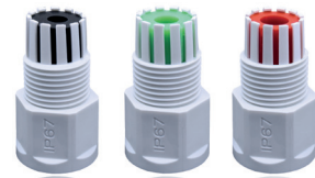
The XT package includes three different compressible glands (black, green and red as above), for different network cable diameters, to ensure a tight seal.

LONGSPAN Max XT camera provides long distance network connectivity with maximum POE to the IP camera in a simple-to-install package