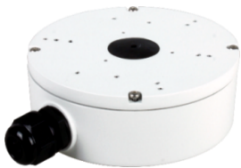
A22 JUNCTION BOX